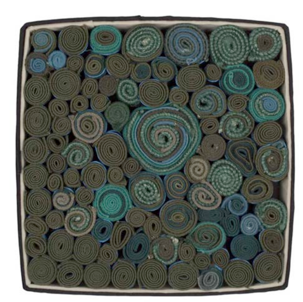
Freedom (2013)