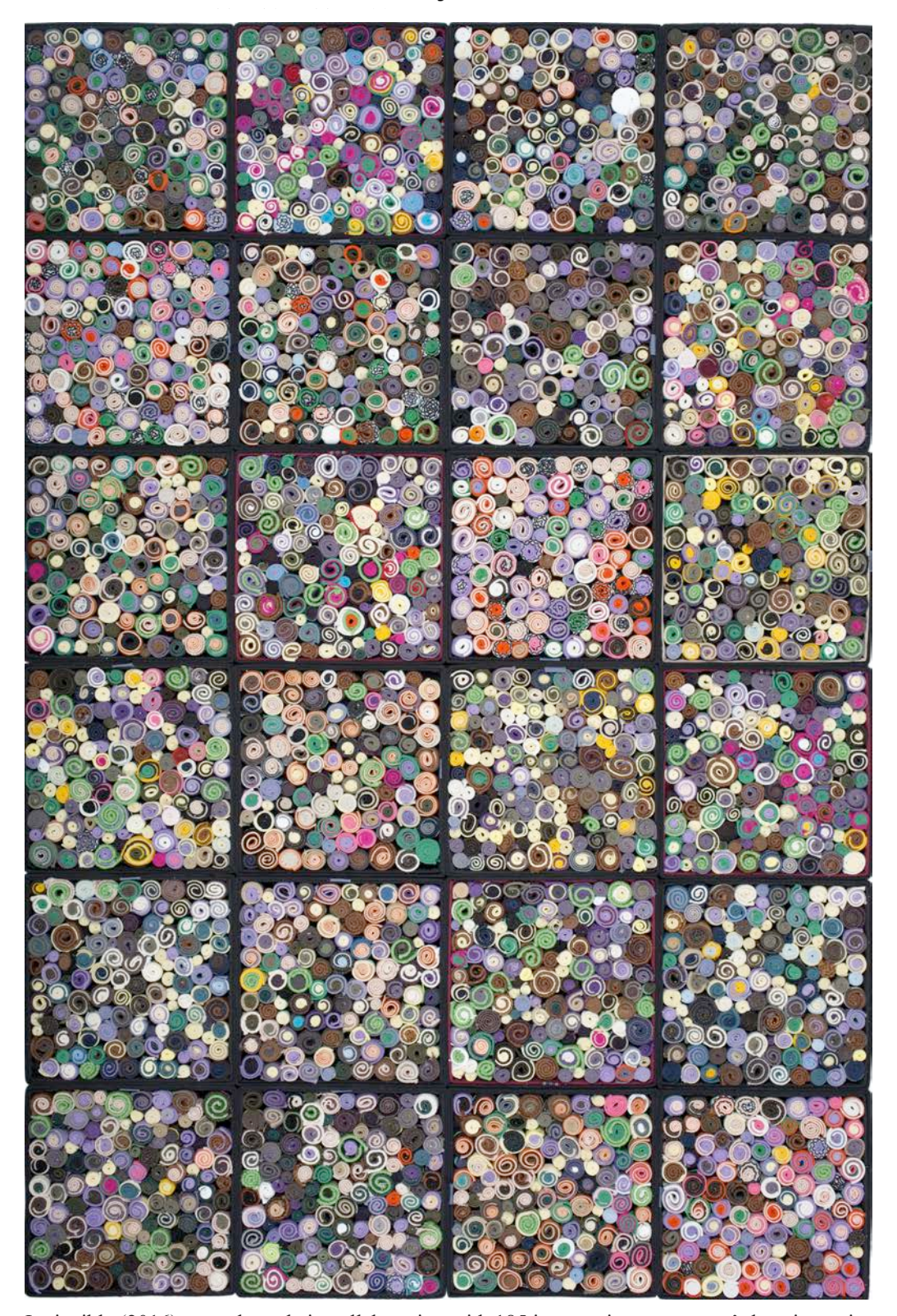
Invincible (2016), a work made in collaboration with 185 inmates in two women's housing units at Rikers Island Correctional Facility over two years. The title came from a participant who wrote: "The name of my scroll is Invincible. That is the way I see my son. He is a person that doesn't never stop going to his goals. [My scroll means] peace, stress free, doing something that will become a part of something bigger."