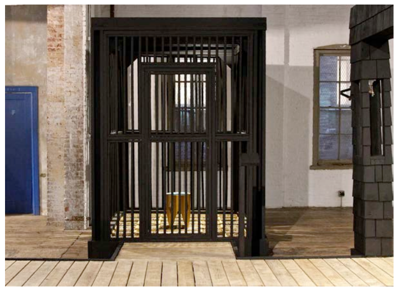
Isolation, part of The Other Side exhibition.

Set against the backdrop of heightened national debate and protests over systemic racism, police violence, and entrenched inequities, the exhibition offers a timely glimpse inside the American criminal justice system—as well as the power of art to uplift and connect. As Steven Ladd tells us, "Art sets the stage for a deeper level of connection. In the context of creating works of art, people open up and share a bit about themselves and their lived experience."