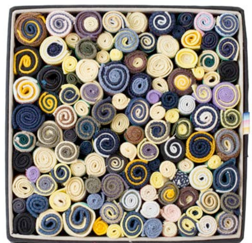
Shades of Rosies (2014); "Rosies" is the nickname for inmates in the jail on Rikers Island that houses women.

Working within the prison setting has, not surprisingly, posed some unique constraints. The Ladds had to adjust the program to meet security demands—replacing pins with rubber bands, avoiding certain colors, and the like. Further, Ladd says, "Within the jail system, there are constant challenges. Funding is basically non-existent. Time is a big challenge, as sometimes we're there most of the day in order to have two hours of actual engagement with inmates. Documentation is a huge problem, as we never have a chance to do the very important photo or video component that is essential to our other Scrollathons. The list really just goes on and on."