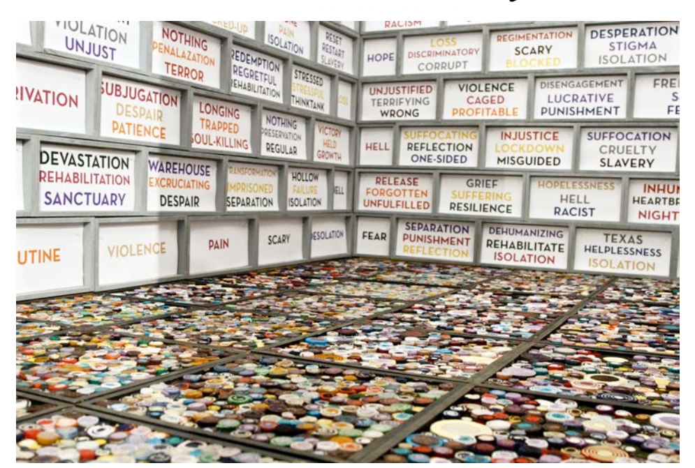
Detail from Jail Cell, featuring inmates' responses to the question: What one word describes incarceration for you?

The Ladds launched their Scrollathon initiative in 2006, originally inspired by their own lack of exposure to the arts growing up. They offered the program in schools first and have since expanded to work with shelters, hospitals, youth missions, and jails, serving over 9000 people throughout the US and abroad to date. Their aim is to reach, as they explain, "underserved, at-risk, and incarcerated populations who have little or no exposure to the arts, giving them creative tools for building skills and sharing their experiences through artistic interventions... engaging people from all walks of life to create museum-quality works of art." The brothers work with museum and institutional partners and have received funding from the likes of