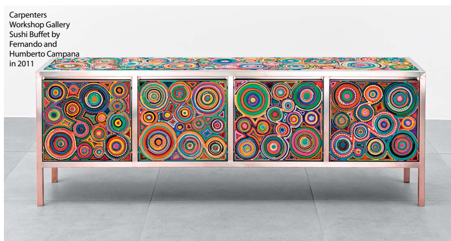
Carpenters Workshop Gallery Sushi Buffet by Fernando and Humberto Campana in 2011