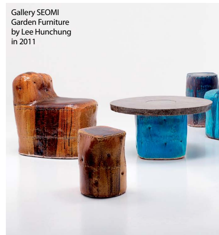
Gallery SEOMI Garden Furniture by Lee Hunchung in 2011