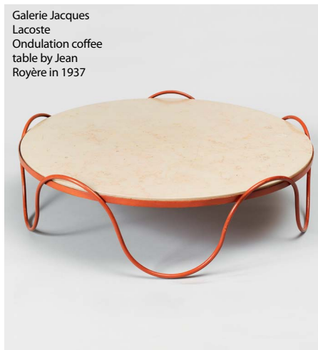
Galerie Jacques Lacoste Ondulation coffee table by Jean Royère in 1937

The success of ART BASEL's spin-off, shows design is coming of age. Here is our best-of-the-best list from 2012