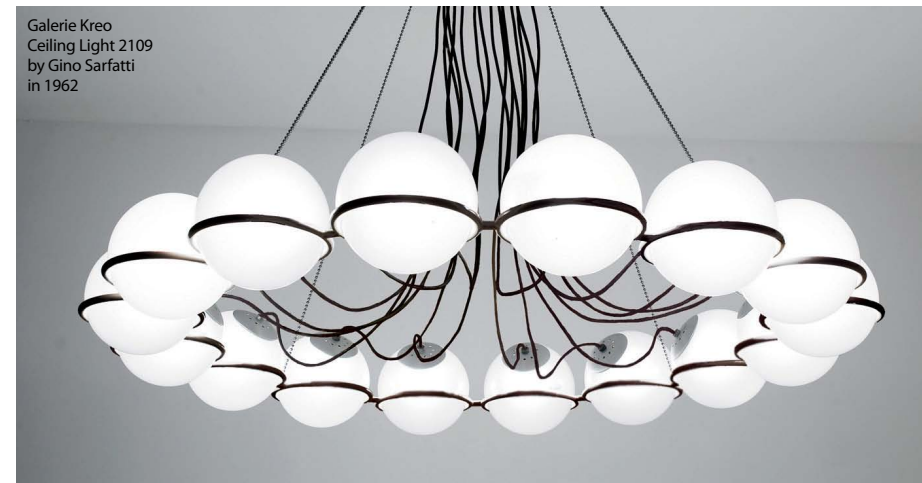
Galerie Kreo Ceiling Light 2109 by Gino Sarfatti in 1962