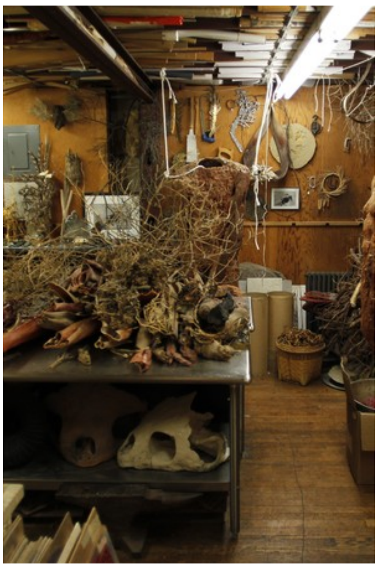
Michele Oka Doner's personal workshop.