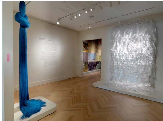
Two works by Olga de Amaral, “Nudo Azul XIII (Blue Knot XIII),” from 2012; and “Luz Blanca (White Light),” from 1969.

cialty, into his designs. The transfer of an old art form into a new setting was a success. But no culture has a corner on innovation. When he wanted to buy a traditional wood-carved Inga canoe, the owners agreed but insisted on covering the boat's exterior with beading. The unheard-of project took six months of steady labor to complete; the boat, with its resplendent surface, is in the show.