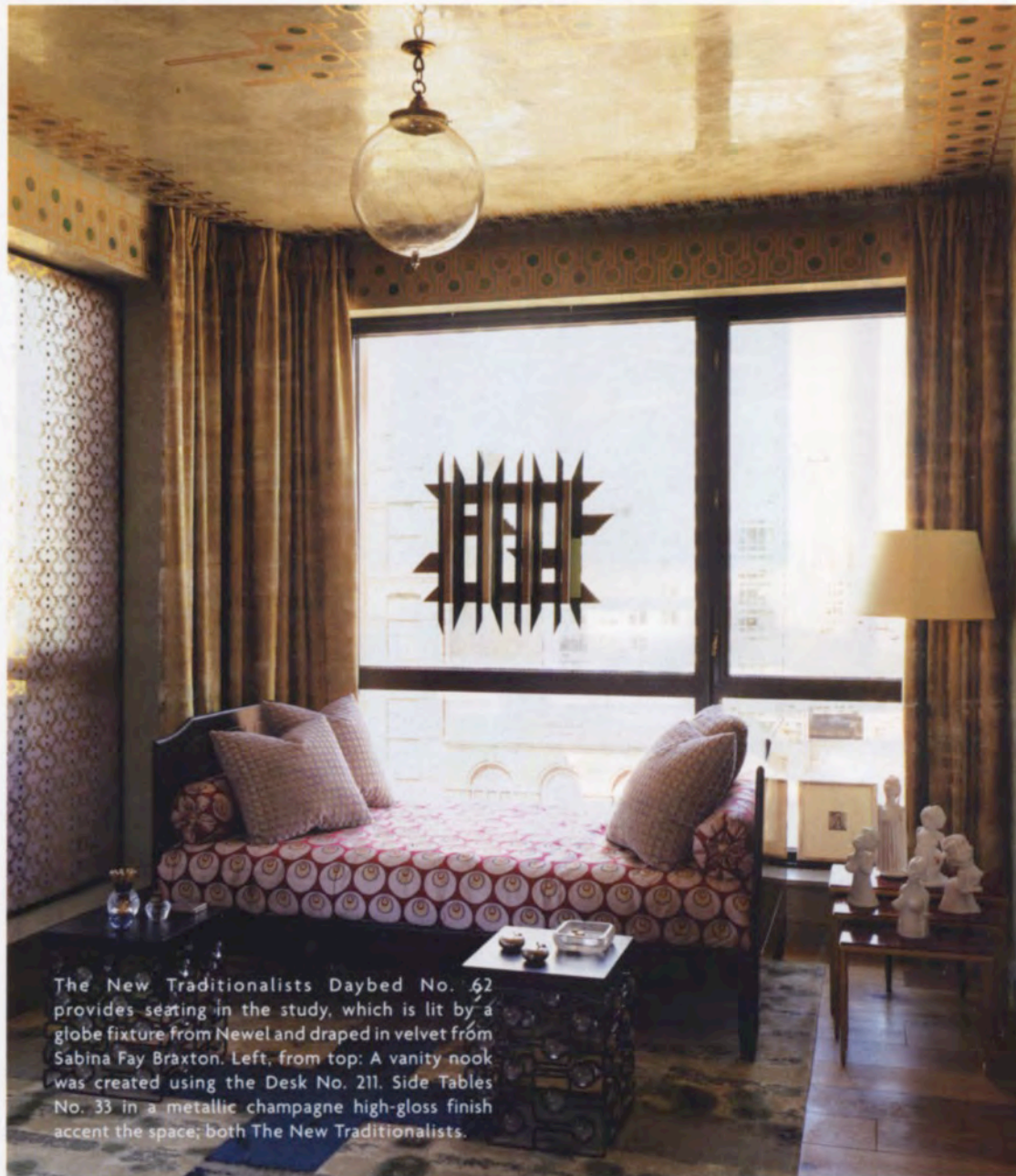
The New Traditionalists Daybed No. 62 provides seating in the study, which is lit by a globe fixture from Newel and draped in velvet from Sabina Fay Braxton. Left, from top: A vanity nook was created using the Desk No. 211. Side Tables No. 33 in a metallic champagne high-gloss finish accent the space; both The New Traditionalists.